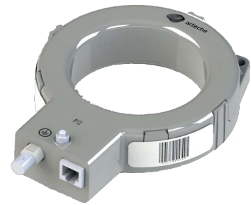
› ICNH-1 current sensor