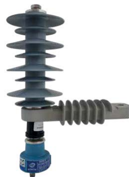
› Overcap: PLC coupler for overhead lines up to 36kV