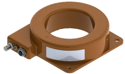
› ICNH-2 current sensor