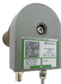
› PlugCap: PLC coupler for MV GIS cubicles

Our range of couplers offers the best performance available in communications. Arteche design allows an easy, quick installation and the safety of both the personnel handling the couplers during the installations and the safety of the electrical network.