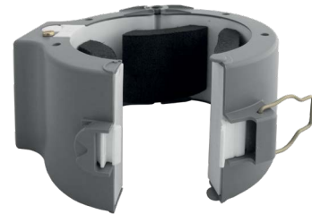
› Split core Rogowski sensor