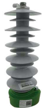
› Undercap: PLC coupler for overhead lines up to 36kV