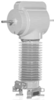
OUTDOOR 60 Hertz

ARTECHE CE series are dry type outdoor service top-core current transformers. The core is encapsulated with Type B epoxy resin which provides excellent internal dielectric properties and mechanical strength. The external layer of Cycloaliphatic Epoxy Resin (CEP) provides resistance to ultraviolet rays and the effects of tracking and erosion on the exterior of the transformer ensuring a long mechanical and electrical life. The transformer is maintenance free.