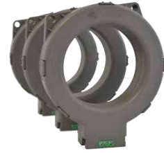
› ICN current sensors