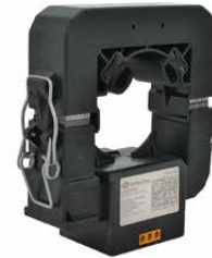
› Split-core phase LPCTSC