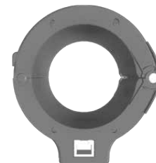
› Split core rogowski sensor