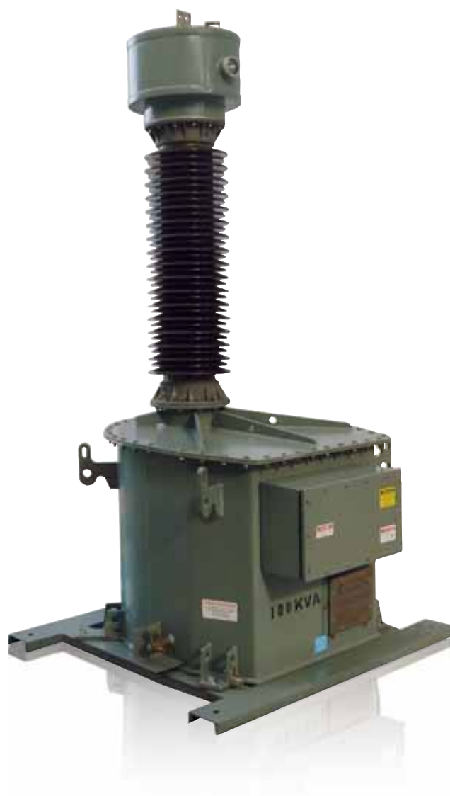
> Model UTP

Gas insulation: model UG up to 550 kV and 100 kVA.