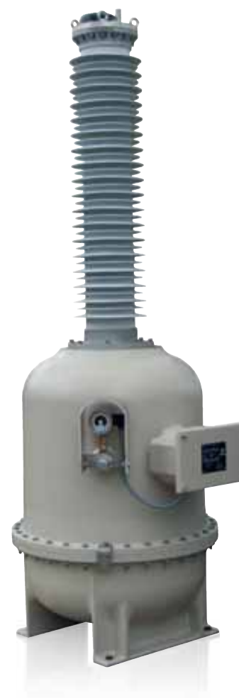
> Model UG