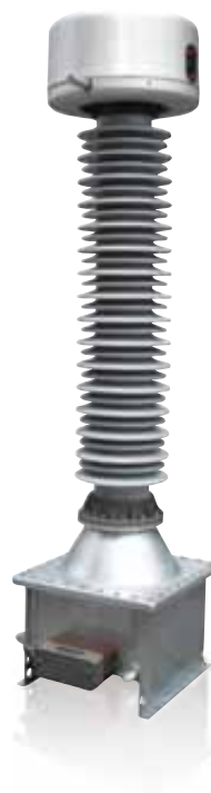
> Model UT