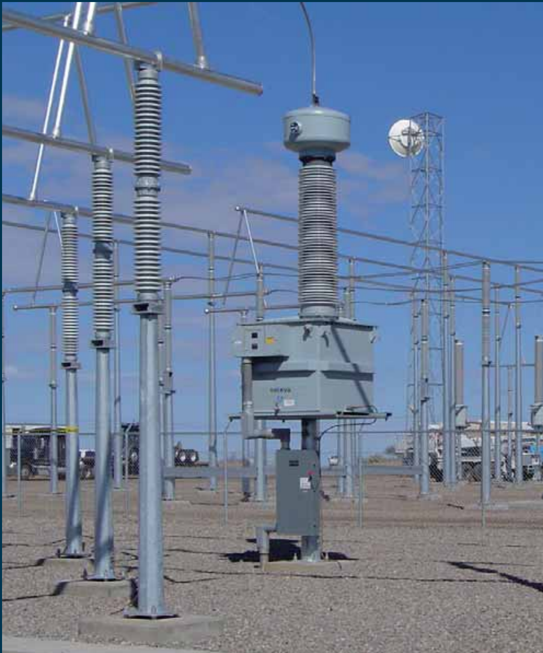
› 245 kV Transformer for substation auxiliary services, model UTP. Coyote Switch (USA).