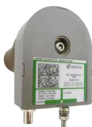
› Plugcap: PLC coupler for MV GIS cubicles

Our range of couplers offers the best performance available in communications. Arteche design allows an easy, quick installation and the safety of both the personnel handling the couplers during the installations and the safety of the electrical network.