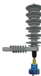
› Overcap: PLC coupler for overhead lines up to 36kV